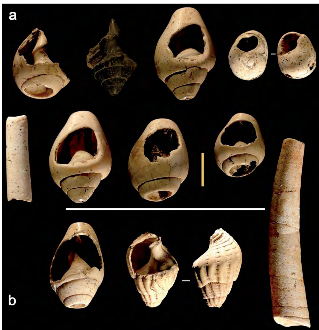
Figure 2. Columbella rustica , Cyclope sp. and Antalis sp. from Mesolithic levels of Guilanyà. In the lower part Columbella , Nassarius reticulatus and Antalis sp. from level E. (b) Note the intensely polished surfaces and the remodelling of (a) the perforations, which suggests a long use (graphic scale 5 mm).